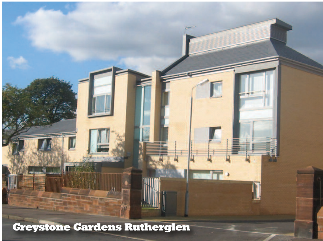
Greystone Gardens Rutherglen