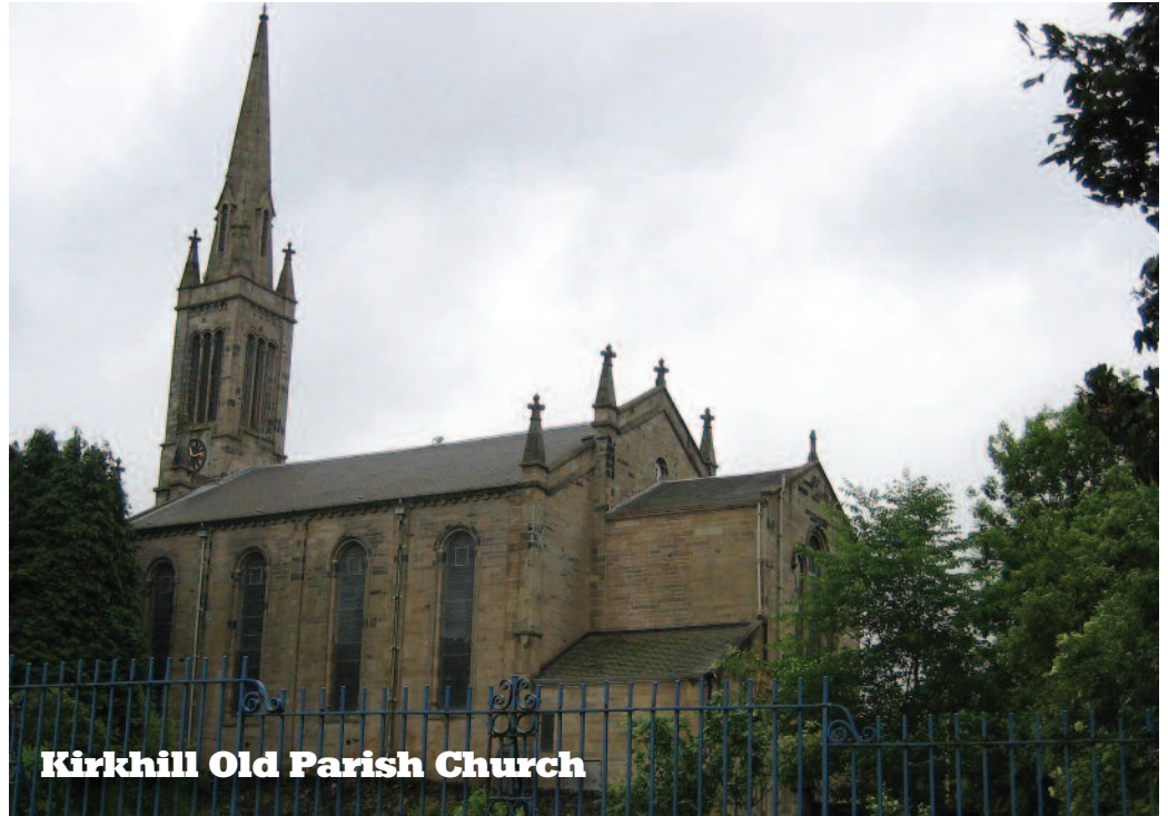
Kirkhill Old Parish Church