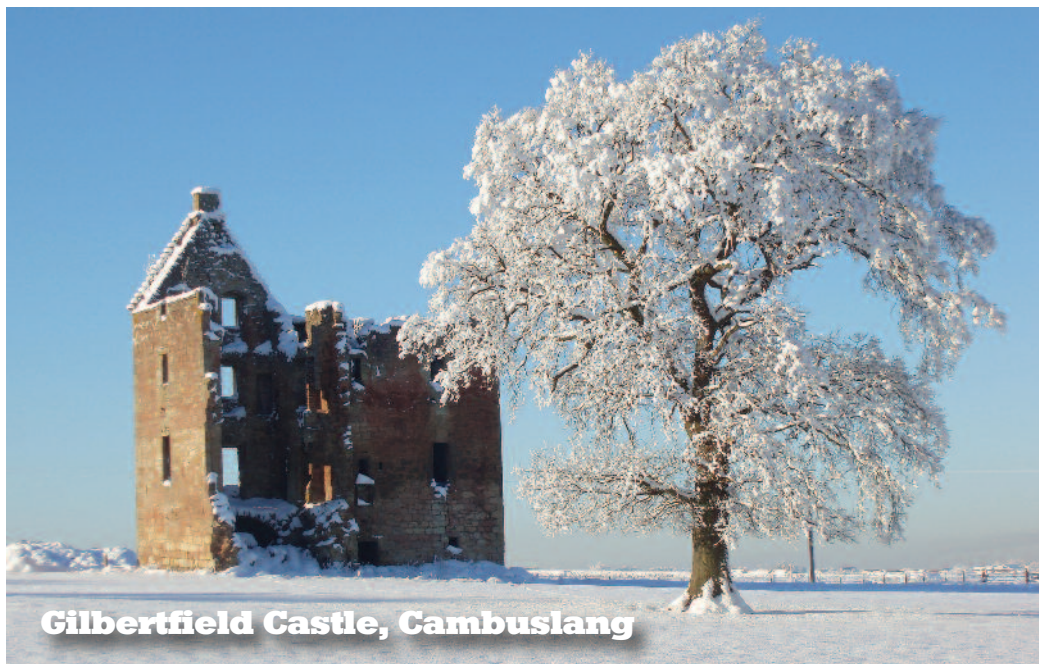
Gilbertfield Castle, Cambuslang