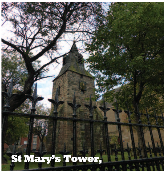
St Mary's Tower,