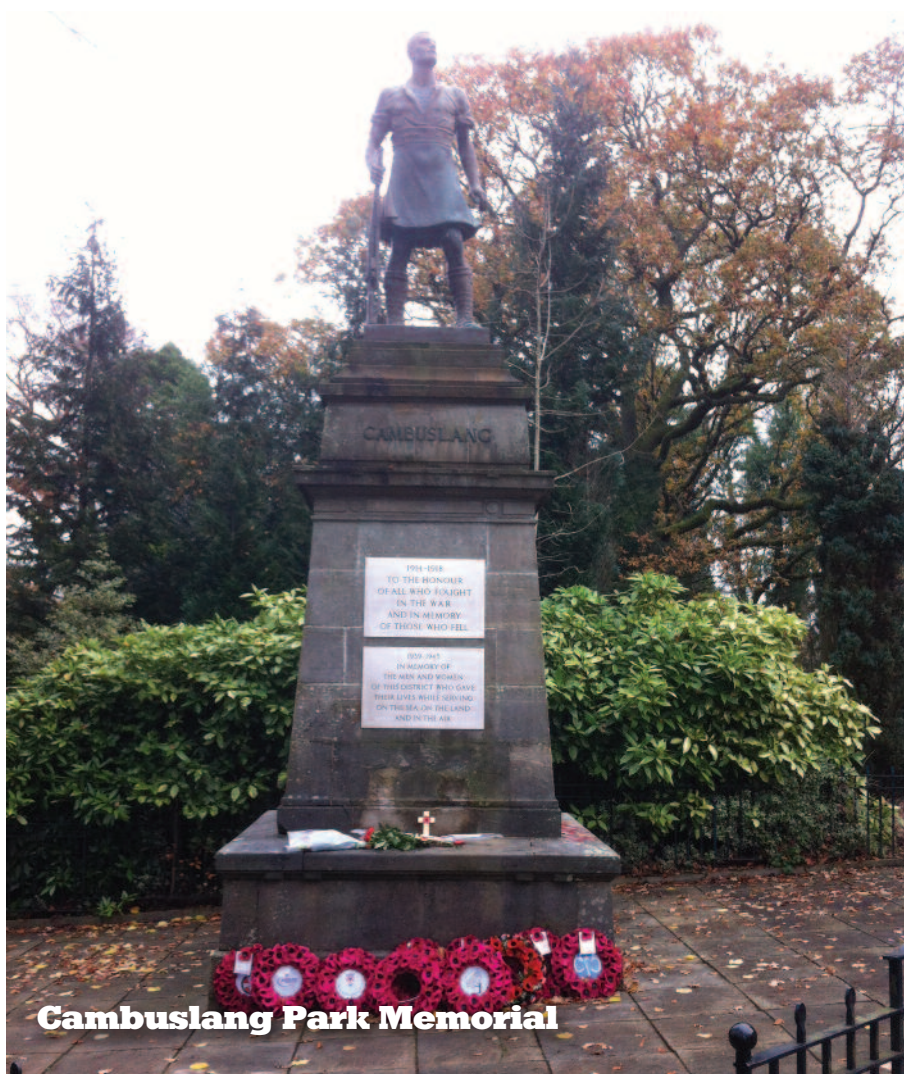
Cambuslang Park Memorial