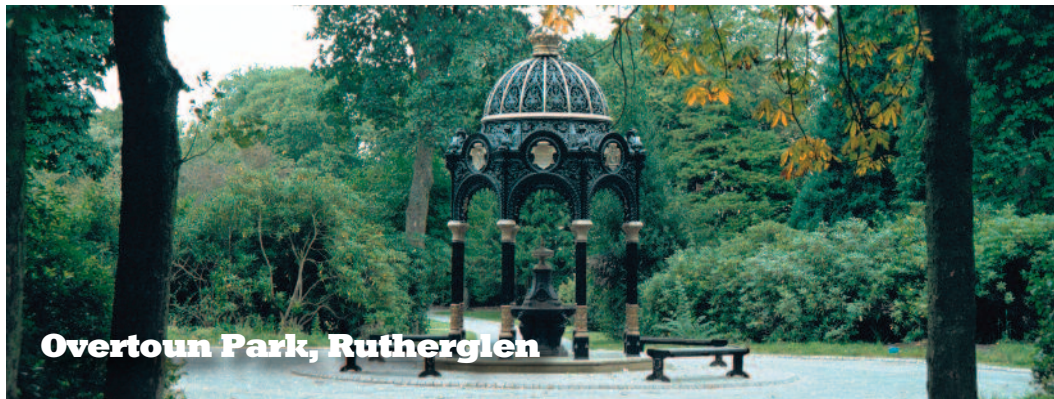
Overtoun Park, Rutherglen