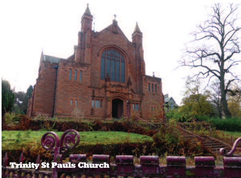
Trinity St Pauls Church