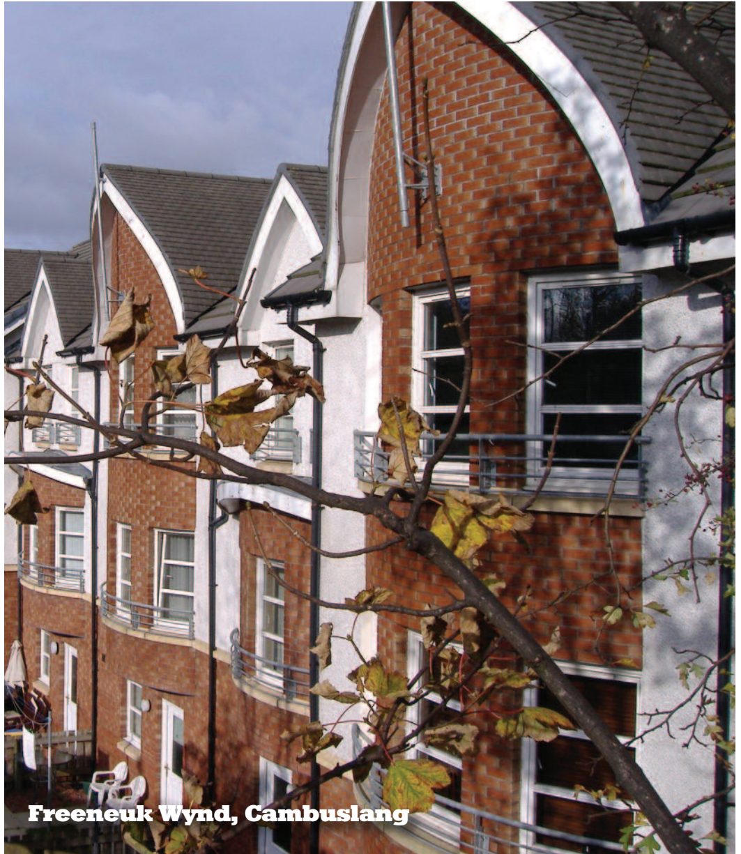
Freeneuk Wynd, Cambuslang