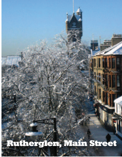
Rutherglen, Main Street