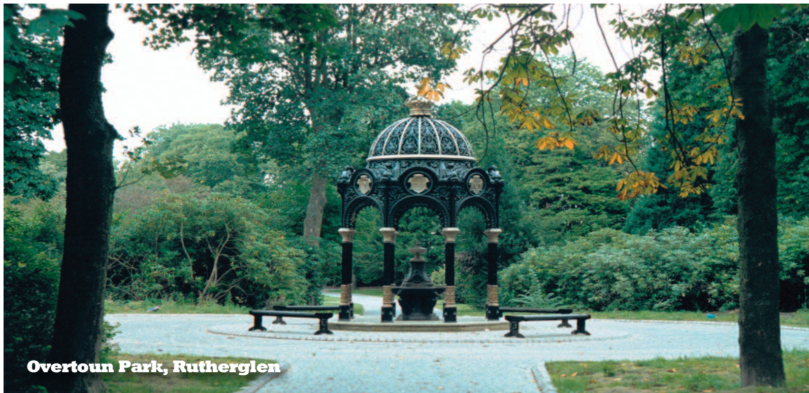
Overtoun Park, Rutherglen